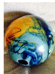
At right: Norm Duke’s bowling ball.