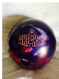
At left: Pete Weber’s bowling ball.